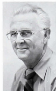
Glenn Miller 38 years