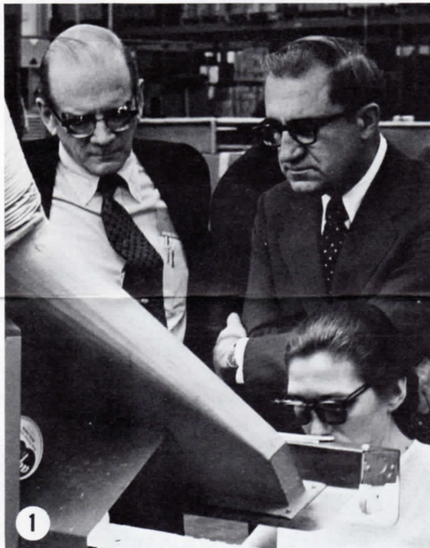
Among the Works employees involved in the tour were

Prior to visiting the shops, the group viewed a cost reduction presentation in the Administration Building.