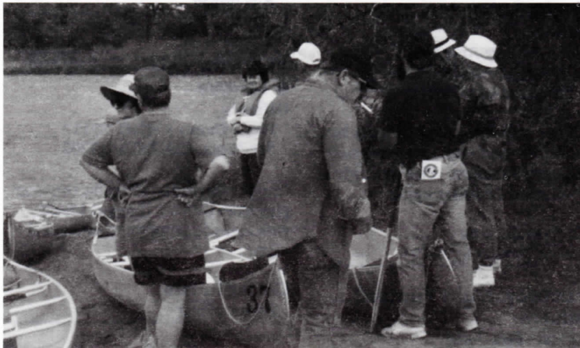
WEOMA Club photo

Annual Christmas party: Organizes and oversees annual Christmas party on Works premises for employees and their families.