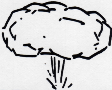
AIR OR NUCLEAR ATTACK

FOLLOW CIVIL DEFENSE SIGNS AND DIRECTIONS OF EVACUATION SQUAD LEADERS TO DESIGNATED SHELTER AREA.