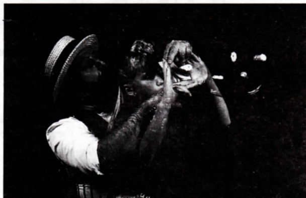
Discover Professor Pop in Tom Sawyer's Landing.

Springtime Fun & Romance In America's Past