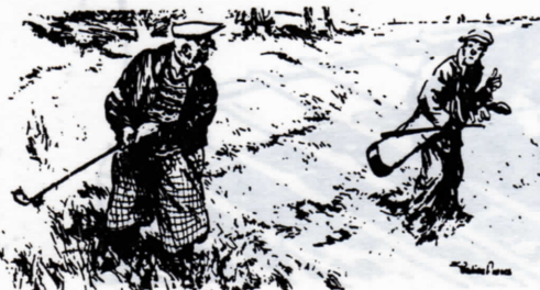
Irate Golfer. "What are you shouting 'Fore' for?" Caddie. "So's they'll know it's golf we're playin'!"