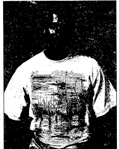
DOCK OF THE BAY