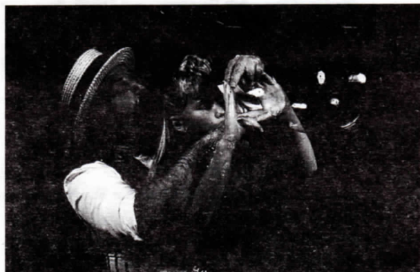
Discover Professor Pop in Tom Sawyer's Landing.

Springtime Fun & Romance In America's Past