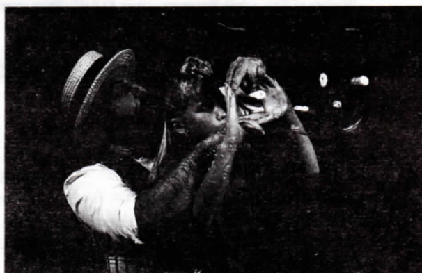
Discover Professor Pop in Tom Sawyer's Landing.

Springtime Fun & Romance In America's Past