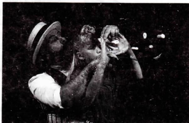
Discover Professor Pop in Tom Sawyer's Landing.

Springtime Fun & Romance In America's Past