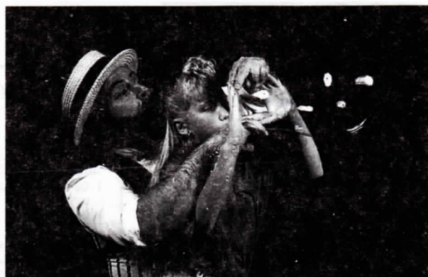
Discover Professor Pop in Tom Sawyer's Landing.

Springtime Fun & Romance In America's Past